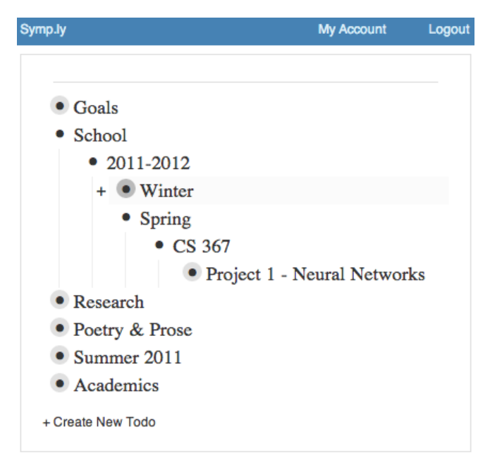
Figure 1. An illustration of the collapsable items of Symp.ly. The items that whose bullets are shaded in gray represent items that are collapsed and have more children nested under them. This allows users to hide items that are not currently relevant to the hierarchical context.

We will see that our answer to the latter question will naturally provide an answer to the former. In short, we do believe that users care about as many layers of nesting as the application can provide. We believe that the number of levels of nesting should solely be the user's decision. The application should not limit a user's need for nesting in any way, and